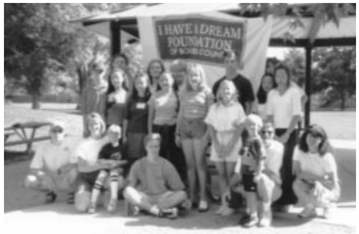
Lafayette Dreamers and families at the Fall Picnic.

From the Boulder County Prevention Connection, Assets Newsletter