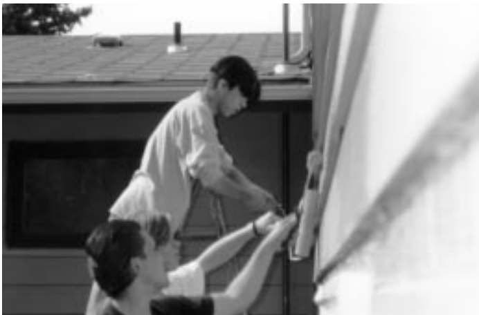
On Make A Difference Day, Lafayette Dreamers painted a youth shelter (top) and Kalmia Dreamers (bottom) learned about plant ecology with the CU Community Relations Department.

"I think it helps him feel more confident about his future, so he works harder now. He thinks about long-term goals and not just about today." -- Parent