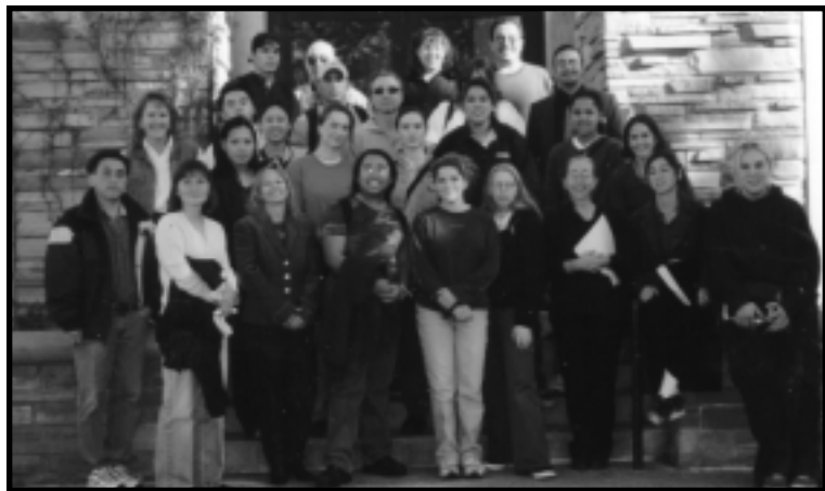
Lafayette Dreamers at College Camp on CU Campus

Workshops were held in the evening on Friday and all day on Saturday. The students focused on the completion of college applications, as well as essay writing workshops utilizing computers under the guidance of CU and IHAD staff members. On Saturday, there were additional application and essay writing workshops, as well as a student panel on College Life which included the involvement of parents, a workshop on Issues for First-Generation College students, and an interactive session on Financial Aid. This was an excellent opportunity for the Dreamers to begin the college application process with the assistance of admissions experts. We wish the Dreamers the best of luck as they make plans for next year!