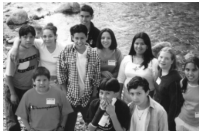
Dreamers at the "Poetry Slam" event (top). Kalmia Dreamers read to Broadway Dreamers (bottom).