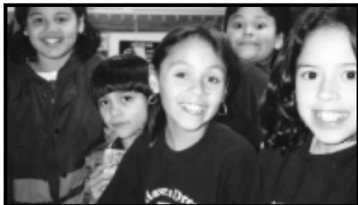
FAC at the Kalmia Community Center

Future activities include a fiesta on Cinco de Mayo, animal appreciation day, clay art and environmental days. A list of monthly activities is posted at the Kalmia Community Center. The club is open to any and all Dreamers. Please stop by and join us!