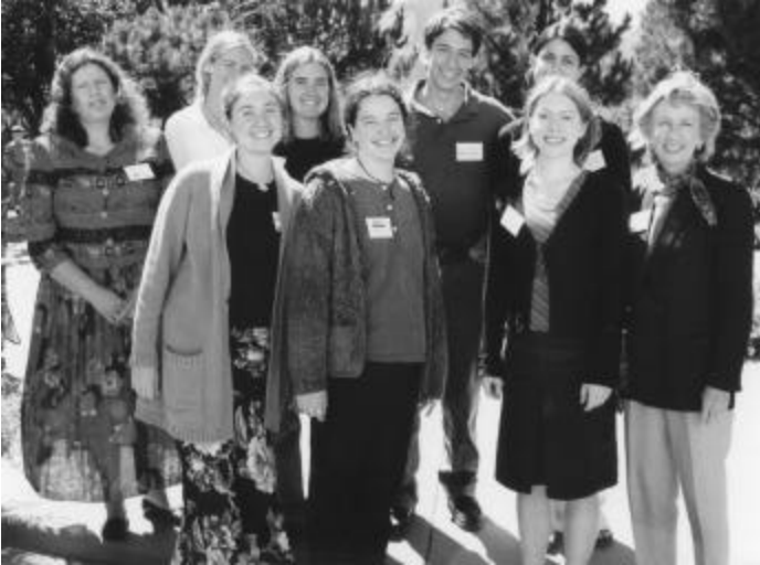
2001-2002 AmeriCorps members at IHAD's Annual Luncheon.

AmeriCorps (A*C) is best described as a “domestic Peace Corps.” Full-time A*C members serve in communities of need and make a one-year (1,700 hour) commitment to service. A*C members receive a “living stipend” of $10,000 and an Education Award of $4,725 upon the completion of their commitment. However, A*C members are typically not receiving anywhere near the financial compensation that they should given their dedicated efforts during their year of service to their communities and our country. This is certainly true for the 14 full-time and three part-time A*C members who are serving with the “I Have a Dream”® Foundation of Boulder County!