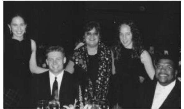
IHAD Project Coordinators at the National IHAD Conference.