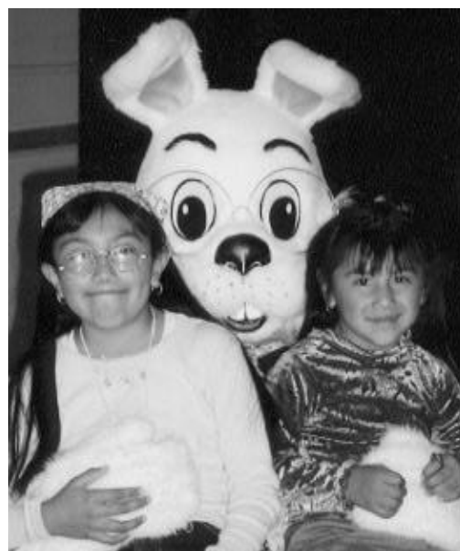
Pioneer Dreamers enjoy a visit with the Easter Bunny at a Spring Volunteer Appreciation Picnic.