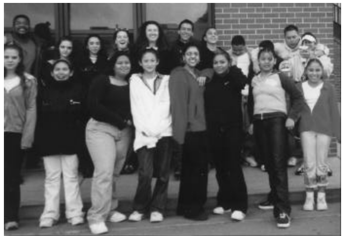
Broadway and Kalmia Dreamers pose after touring the Auraria campus in Denver (Metro, CCD & UCD) and CSU. Dreamers learned about admission requirements, financial aid and a day in the life of a college student.