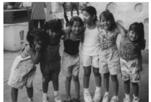
Casa Dreamers enjoy the company of one another on a field trip to Six Flags Elitch Gardens.

On a daily basis we are amazed by the relationships that these children have formed with each other. Recently, we witnessed one third-grader encouraging another to do more math sheets, that way he too could attend our next field trip. Every child knows where the rest of the Dreamers live and they can tell you where they are at any given point in time. For the future we are looking to use this feature of our class to strengthen our programming activities. By delegating responsibilities to the older Dreamers, we hope to create a cascade learning approach that will further the development of our younger Dreamers, providing them with role models that are none other than their own sisters and brothers.